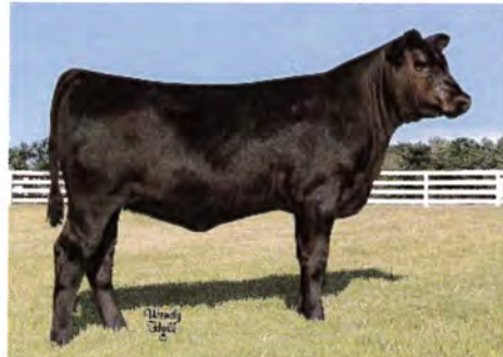
Dtr: JOOURNEY x VAR Upfront 0392, Vintage Blackcap 5120, Vintage Angus Ranch, CA

This young bull is AI Sired by the impeccable Journey 1X74 bull on top and a solid SydGen C C & 7 bull on bottom. His pedigree is packed with performance, soundness and efficiency. This bull has an ideal maternal combination coupled with moderate size and outstanding Heifer Pregnancy and Docility EPDs. He would be a great asset to any herd for added feed efficiency, soundness and quality.