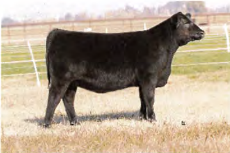
Dtr: JOURNEY x TRUST, EZAR Royal Lady 5026, EZ Angus Ranch, CA

Recommended for consideration in mating daughters of these sires and or sire lines: 7229, BRUISER, PAYWEIGHT 1682, RAMPAGE, RESERVE, RESOURCE, SPECIAL FOCUS, TEN X, UPSHOT, WAYLON